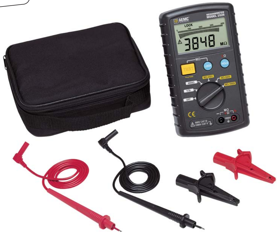
Soft carrying case and test leads included